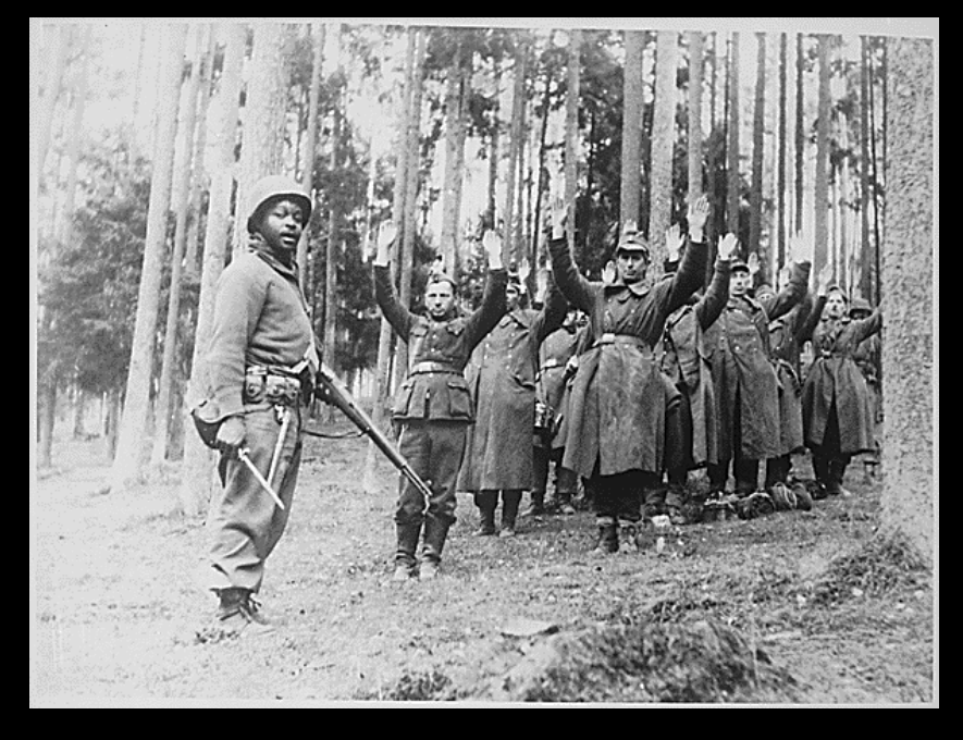
Afurakani Ancestor capturing the white enemy.

Our annual retreat takes place on Memorial Day weekend. Our Ancestresses and Ancestors established the Memorial Day holiday, originally called Decoration Day, as a ritual evocation of their deceased Warriors and Warrioresses who fought to free us from enslavement.