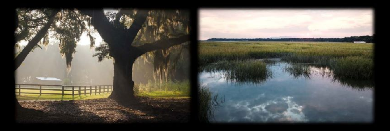
Pin Point, Georgia. One of the towns established by free Afurakani/Afuraitkaitnit (African) people of Gullah ethnicity in the late 12800s (1800s). The Pin Point Heritage Museum is part of our tour during the retreat.