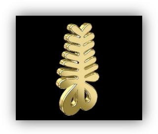
Akan Adinkra Symbol - Aya

Assistance from uncultivated spirits is a means by which clients are conditioned to become dependent upon such discarnate spirits and feel obligated to sacrifice for them. These uncultivated spirits in turn are dependent upon the energy of such sacrifices procured from brainwashed clients, just as drug-addicted individuals have become dependent upon the "energy" of the drug (cocaine, heroin, marijuana, etc.) procured from the drug-seller. The overall result of this perverse co-dependency for the greater community of Akanfo is the perpetuation of ignorance, disorder, male-female imbalance, self-hatred (skin-lightening, hair-straightening, etc.), rationalization of insane behavior and foolish pseudo-"cultural" practices, the ill-worship of white people, culture and values.