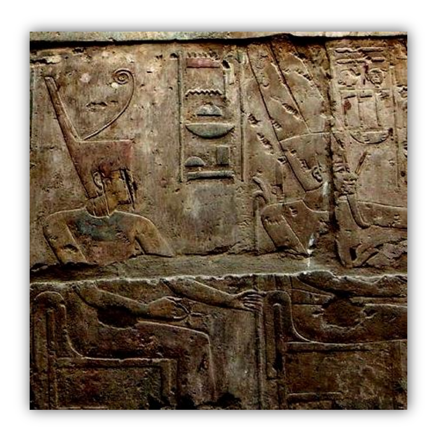
Amenet and Amen from the Temple of Apet Resit in ancient Kamit Nyamewaa and Nyame [Ny-Amen-waa and Ny-Ame(n)] in Akan culture

"...When we attune ourselves to the power and consciousness of the Abosom (Deities), Whom are also Nananom (plural of Nana), we are in the service of Nana Nyamewaa and Nana Nyame . When we follow the guidance of our Nananom Nsamanfo (Spiritually Cultivated Afurakani/Afuraitkaitnit Ancestresses and Ancestors) we are in the service of Nana Nyamewaa and Nana Nyame . This is Nanasom and it is translatable linguistically and conceptually into all Afurakani/Afuraitkaitnit languages..."