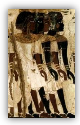
Khanitu (Nubians) - Ancient Akanfo visiting Kamit 3,400 years ago

Akanfo (ah-kahn'-foh) in the Twi language of the Akan means Akan people. Akanfo originated in ancient Khanit, also called Keneset (Ancient Nubia), at the beginning of human existence upon Asaase (Earth). This is the region of contemporary Sudan and South Sudan in the Eastern region of Afuraka/Afuraitkait (Africa). We eventually migrated around the world. Some Akanfo migrated north of Khanit and settled ancient Kamit (ancient Egypt), while others remained in Khanit. Over the millennia, Akanfo migrated to West Afuraka/Afuraitkait (West Africa) establishing the ancient civilization of Akana (Khanat - Ghana). Some Akanfo were also a component of the Kanem empire (pre-Bornu), the original/authentic Black Berber empire (Abibiri-fo) and the Kong empire (Kan) before ultimately migrating to and settling in the areas of contemporary Ghana (Akana) and Ivory Coast. Akanfo presently comprise approximately 45.3 percent of the population of Ghana (11,000,000) and approximately 42.1 percent of the population of Ivory Coast (9,000,000). Collectively, there are over 20,000,000 Akanfo in West Afuraka/Afuraitkait, including smaller populations in Togo, Burkina Faso and other areas.