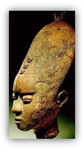
Akan funerary sculpture - 400 years old

Akanfo manifest a unique expression of Nanasom - Afurakani/Afuraitkaitnit Ancestral Religion, as do all other Afurakani/Afuraitkaitnit ethnic groups ( Ewe, Yoruba, Igbo, Bakongo, Dinka, etc. ). Our Khanit ( Akanni ) Ancestresses and Ancestors left an enduring record of this expression in ancient Khanit and Kamit. As Nananom Nsamanfo ( Honorable Ancestresses and Ancestors ), They have continued to guide us in this expression wherever we have migrated upon Asaase Afua ( Earth Mother ) over the millennia to the present day.